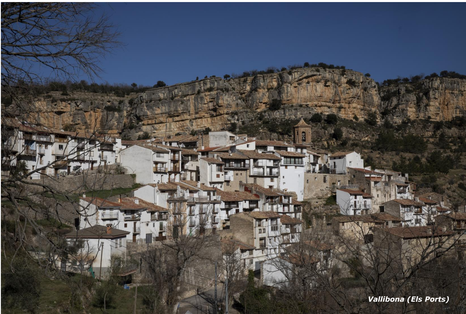
Vallibona (Els Ports)

A second phase of this project will be developed soon under the name Ruta 99 Plus , which will include other municipalities with a higher population. In addition, there will be partnerships with businesses under the project Friends of the Route .