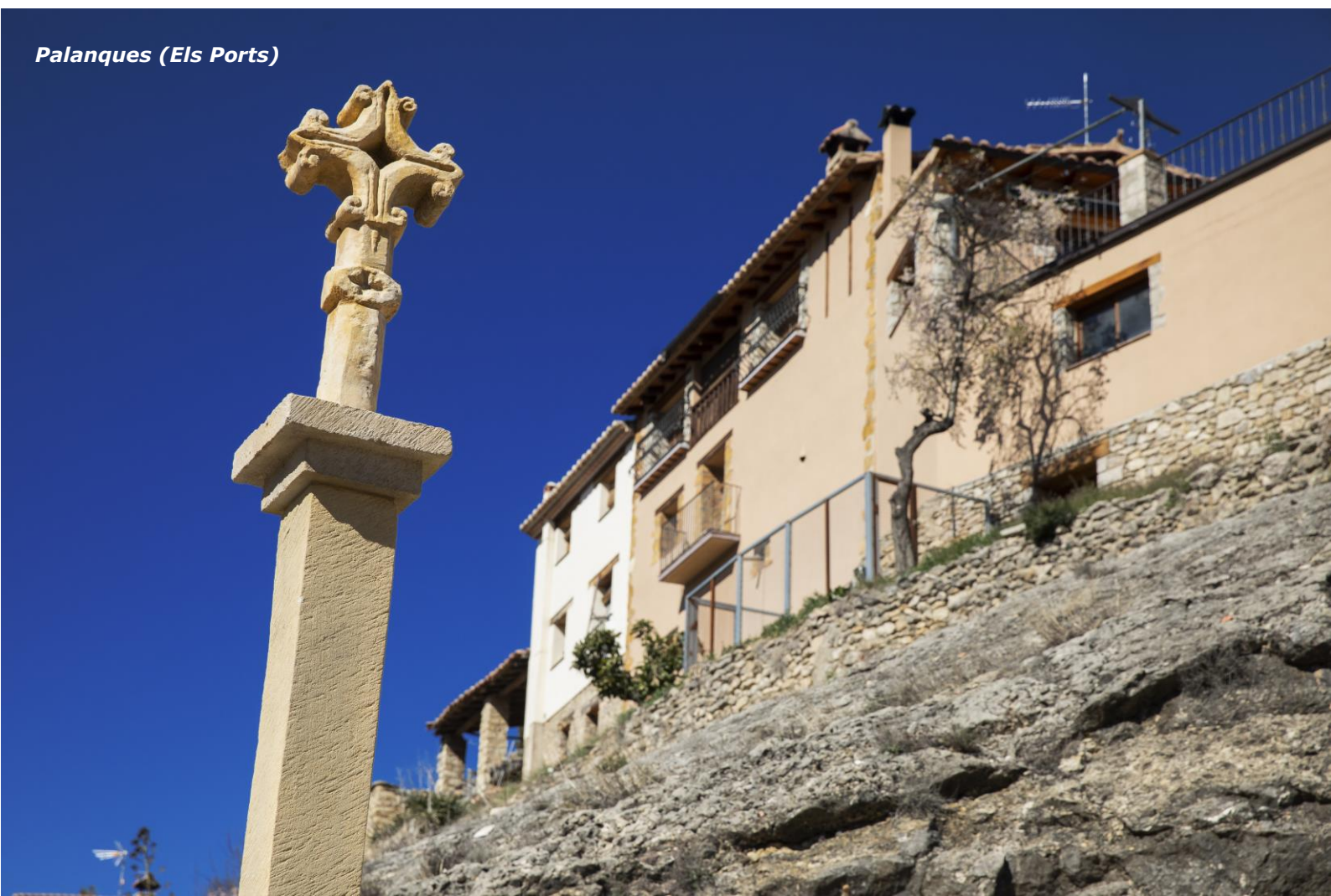
Palanques (Els Ports)

The route can be completed in groups or individually by motorbike, bike or on foot. Likewise, for each stage accomplished on Route 99, different symbolic rewards will be offered to visitors.