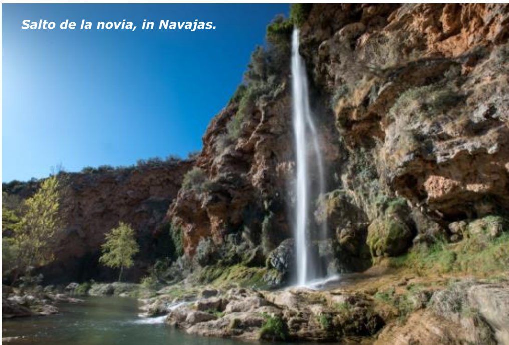
Salto de la novia, in Navajas.

The many routes will allow us to learn about the countless stories, legends, myths, and even some secrets that only the most daring and curious visitors will discover. The Grail Route connects us with the most important relic of Christianity, which has become the most sought-after legend in history. The Templar Route showcases the history of the knight monks and their impressive fortifications. The Cid Route follows in the steps of this legendary medieval knight through picturesque villages and rugged ravines. The Route of the Last Cathars reveals a community that challenged the power of the Vatican in the Middle Ages, sparking a crusade and the birth of the Inquisition.