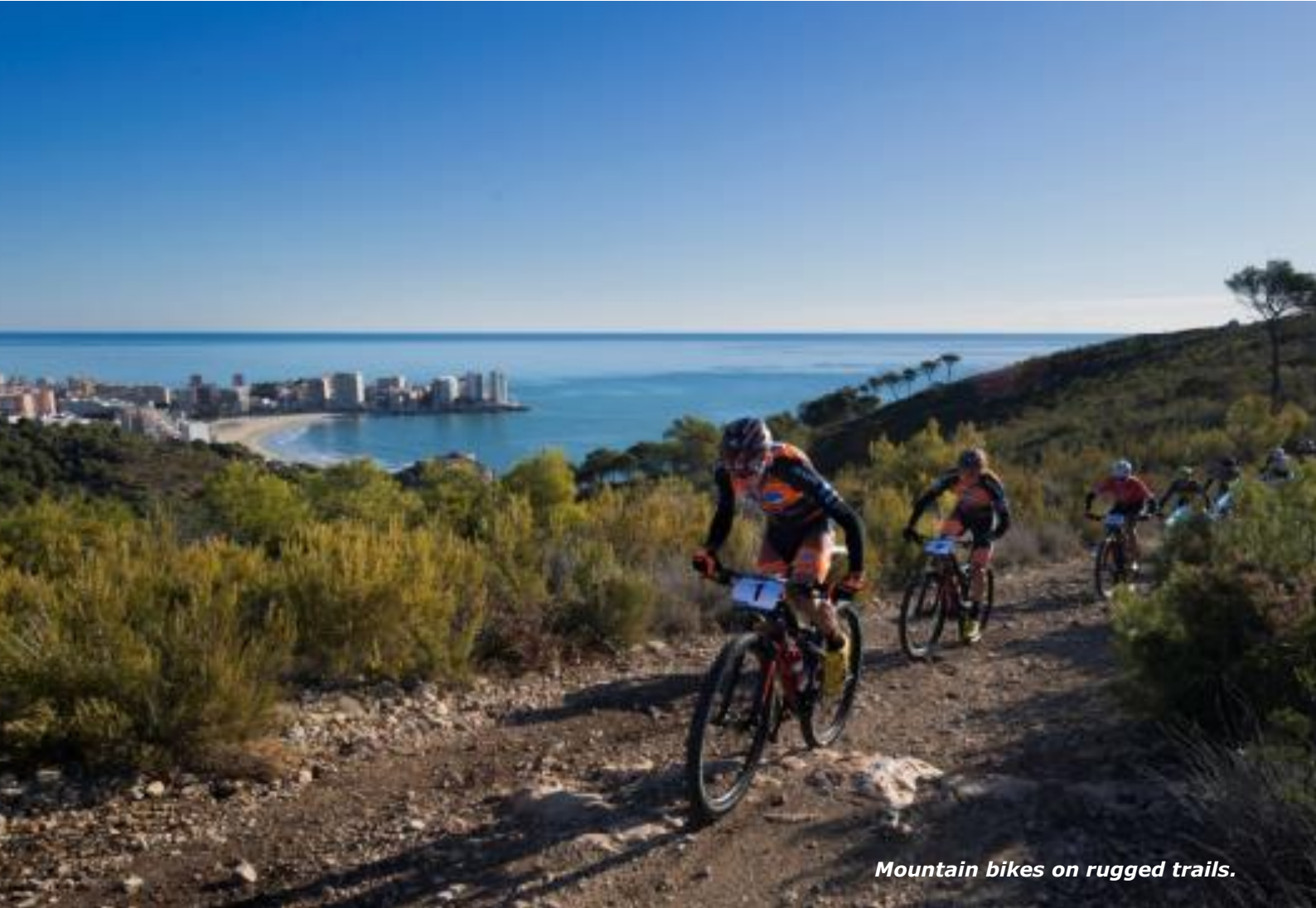
Mountain bikes on rugged trails.

In addition, there is a network of approved and signposted trails to explore the beautiful landscapes of Castellón. There are also multi-activity centres, inland water sports facilities, and golf courses on the edge of the Mediterranean Sea.