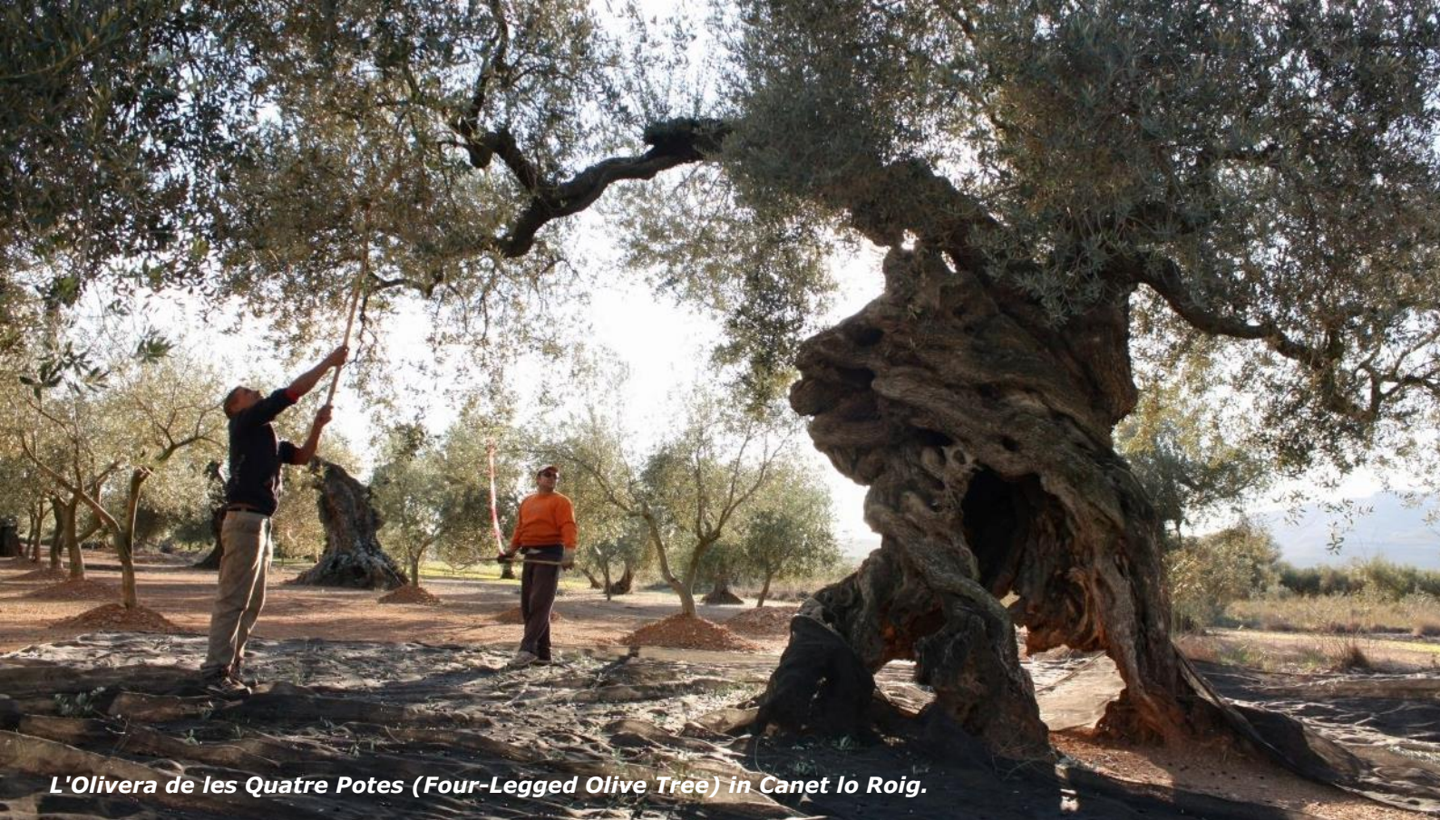
L'Olivera de les Quatre Potes (Four-Legged Olive Tree) in Canet lo Roig.

Seasonal fruit such as oranges, cherries, and melons will refresh us with a delicious mix of Mediterranean flavours. All this is topped off with the excellent and little-known wines produced from well-cared vineyards that produce excellent fruity and aromatic wines, as well as mistela, anise liquor, and herb or Carmelitano orujo prepared using ancestral methods by the Carmelite Fathers in their old cellars.