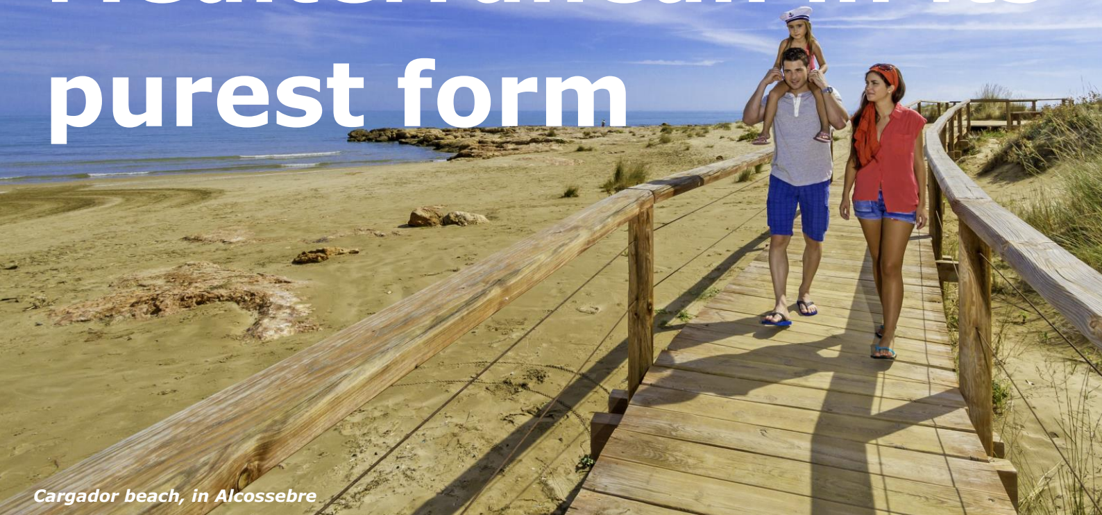
Cargador beach, in Alcossebre

Castellón Airport is the gateway to a destination that is worth discovering given its many and diverse tourist attractions. Its invaluable offer includes extensive fine sand beaches and an exceptional climate—boasting 300 days of sunshine a year. It also has a remarkable historical and artistic heritage, as well as a rich gastronomy.