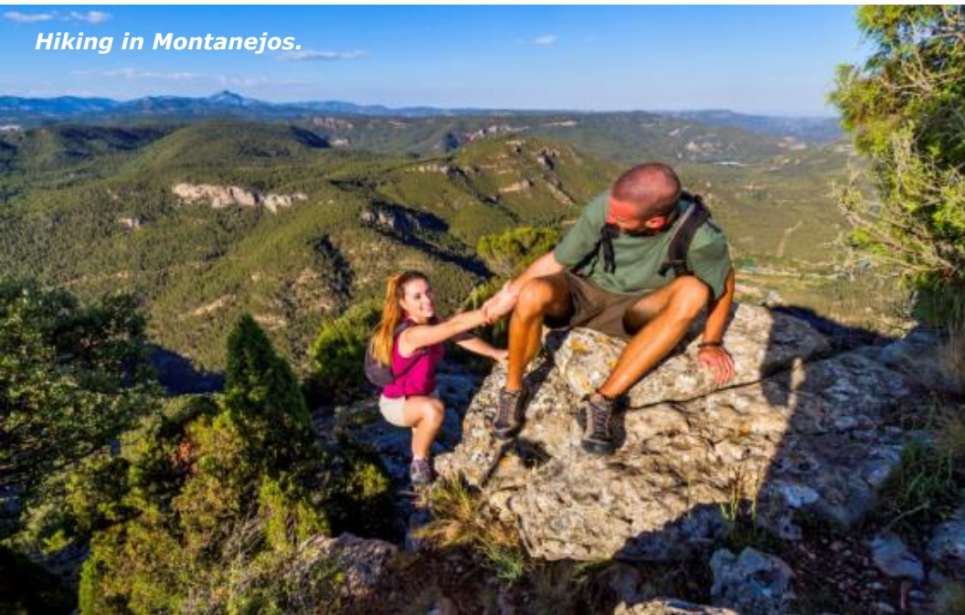
Hiking in Montanejos.

The passage of time across the lands of Castellón is a journey back in time to our most remote past, from the age of dinosaurs, with various fossilised footprints, to the Levantine cave paintings, a World Heritage Site by UNESCO located in caves that are open to the public. There are also castles and fortifications which were conquered by legendary figures such as Aníbal Barca, El Cid Campeador, King James I, Pope Luna, or the Carlist General Cabrera, as well as a multitude of hermitages and