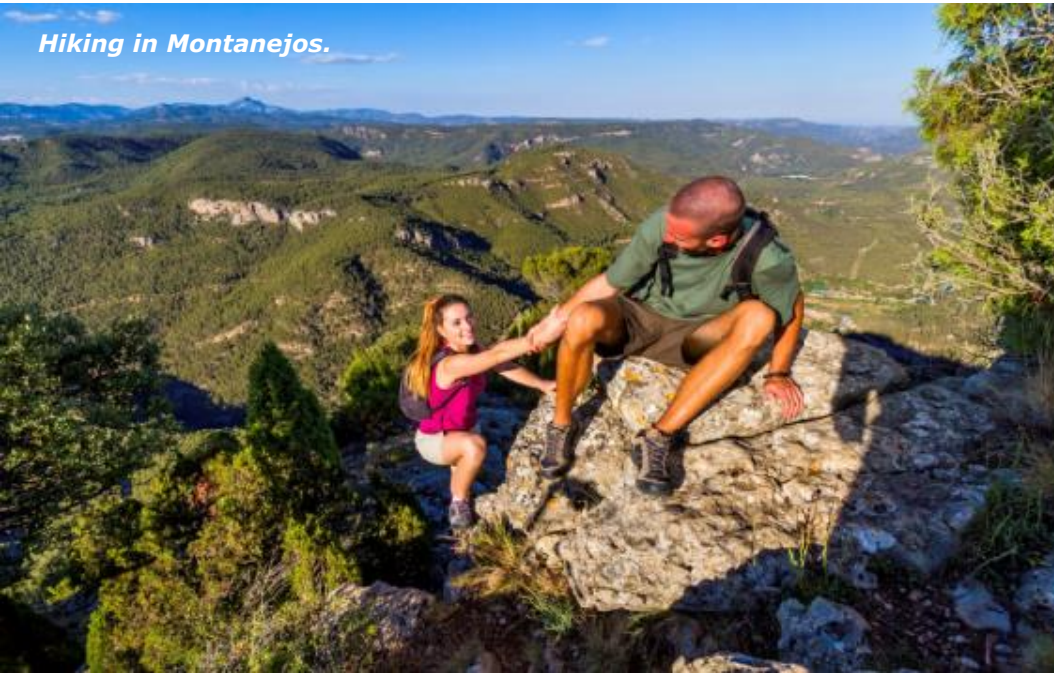
Hiking in Montanejos.

The passage of time across the lands of Castellón is a journey back in time to our most remote past, from the age of dinosaurs, with various fossilised footprints, to the Levantine cave paintings, a World Heritage Site by UNESCO located in caves that are open to the public. There are also castles and fortifications which were conquered by legendary figures such as Aníbal Barca, El Cid Campeador, King James I, Pope Luna, or the Carlist General Cabrera, as well as a multitude of hermitages and