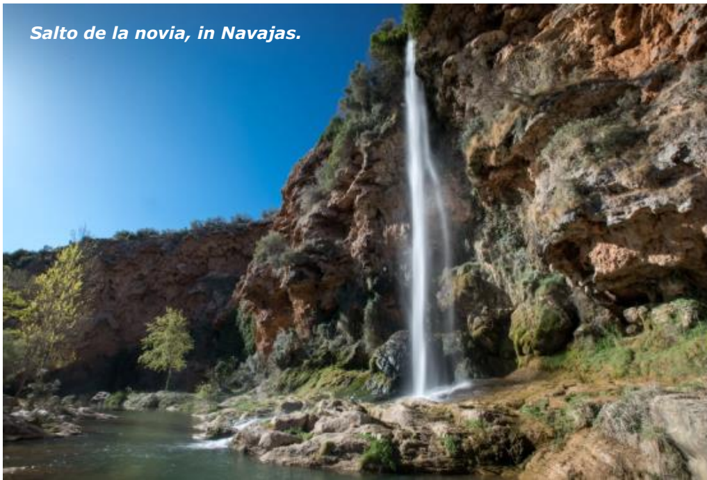
Salto de la novia, in Navajas.

The many routes will allow us to learn about the countless stories, legends, myths, and even some secrets that only the most daring and curious visitors will discover. The Grail Route connects us with the most important relic of Christianity, which has become the most sought-after legend in history. The Templar Route showcases the history of the knight monks and their impressive fortifications. The Cid Route follows in the steps of this legendary medieval knight through picturesque villages and rugged ravines. The Route of the Last Cathars reveals a community that challenged the power of the Vatican in the Middle Ages, sparking a crusade and the birth of the Inquisition.