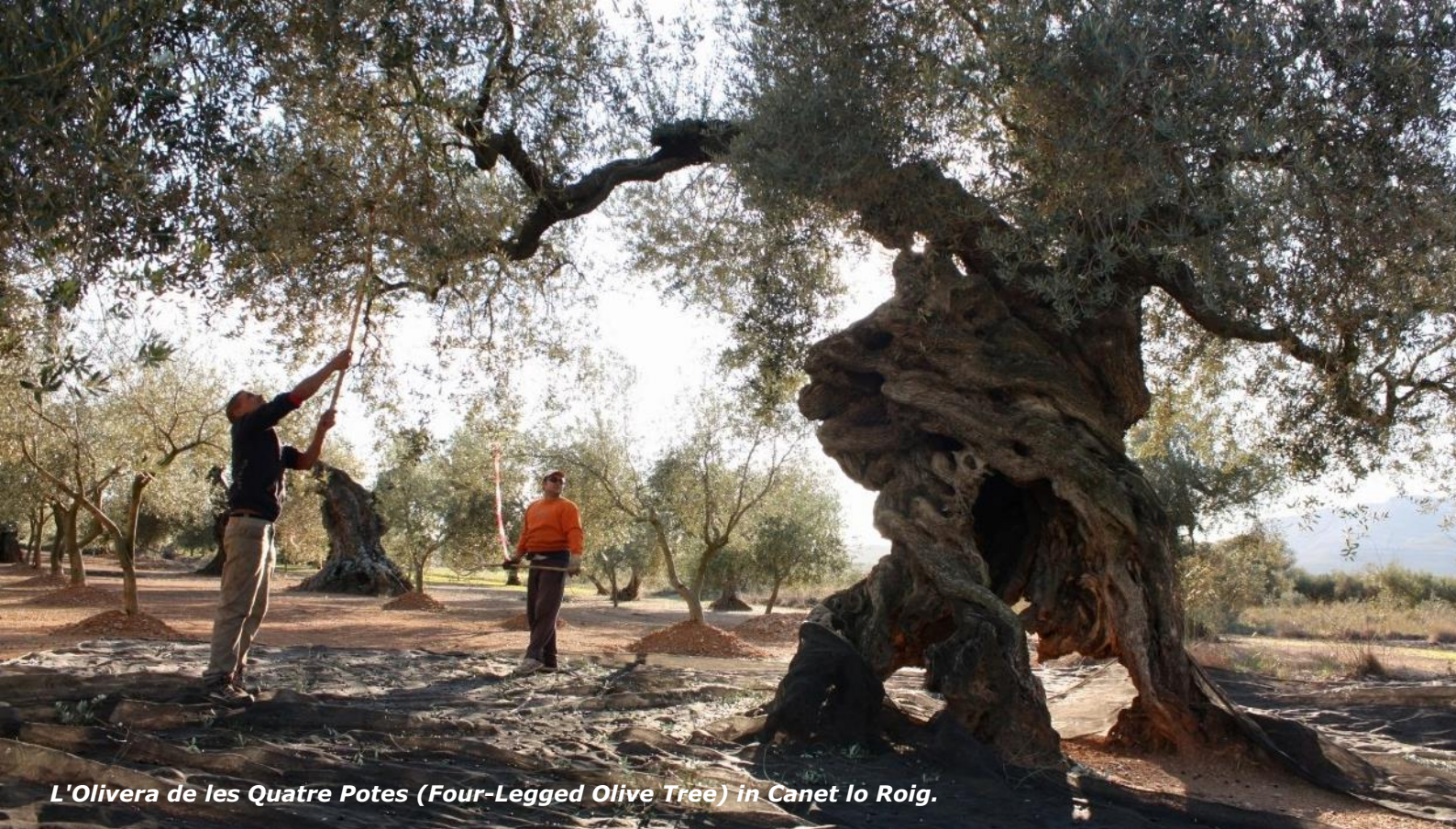
L'Olivera de les Quatre Potes (Four-Legged Olive Tree) in Canet ló Roig.

Seasonal fruit such as oranges, cherries, and melons will refresh us with a delicious mix of Mediterranean flavours. All this is topped off with the excellent and little-known wines produced from well-cared vineyards that produce excellent fruity and aromatic wines, as well as mistela, anise liquor, and herb or Carmelitano orujo prepared using ancestral methods by the Carmelite Fathers in their old cellars.