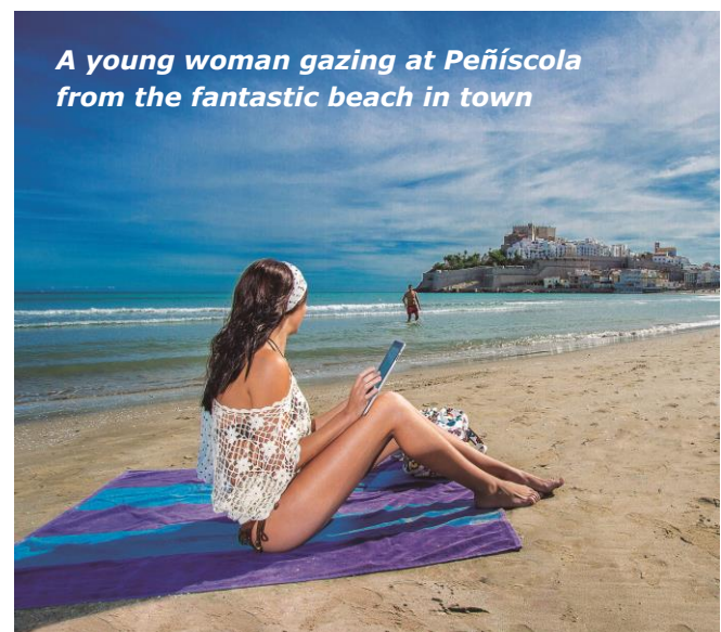
A young woman gazing at Peñíscola from the fantastic beach in town

Each of these destinations have something captivating. Plan a day or two to visit them and feel that Mediterranean essence that truly defines them. Shall we continue with our trip?