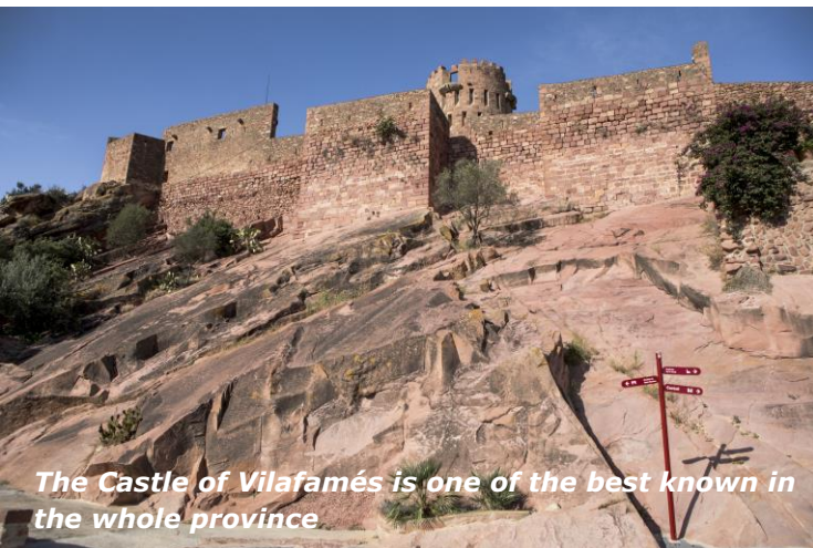
The Castle of Vilafamés is one of the best known in the whole province

will not only enjoy the sea, but also the mountains and its natural park of the Desert de les Palmes. It has it all!