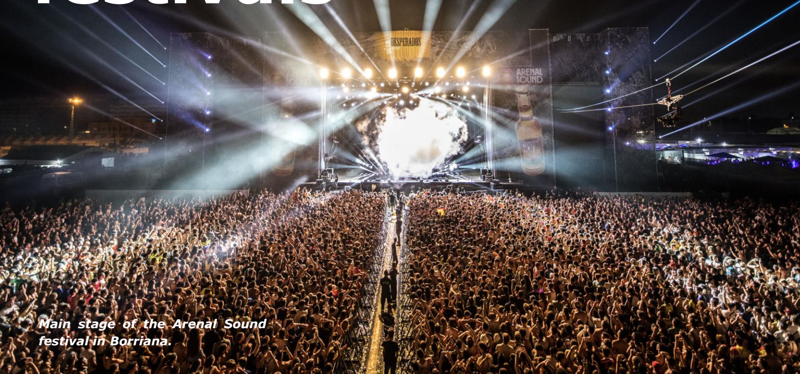
Main stage of the Arenal Sound festival in Borriana.

Castellón hosts some of the most important music festivals held in Europe.